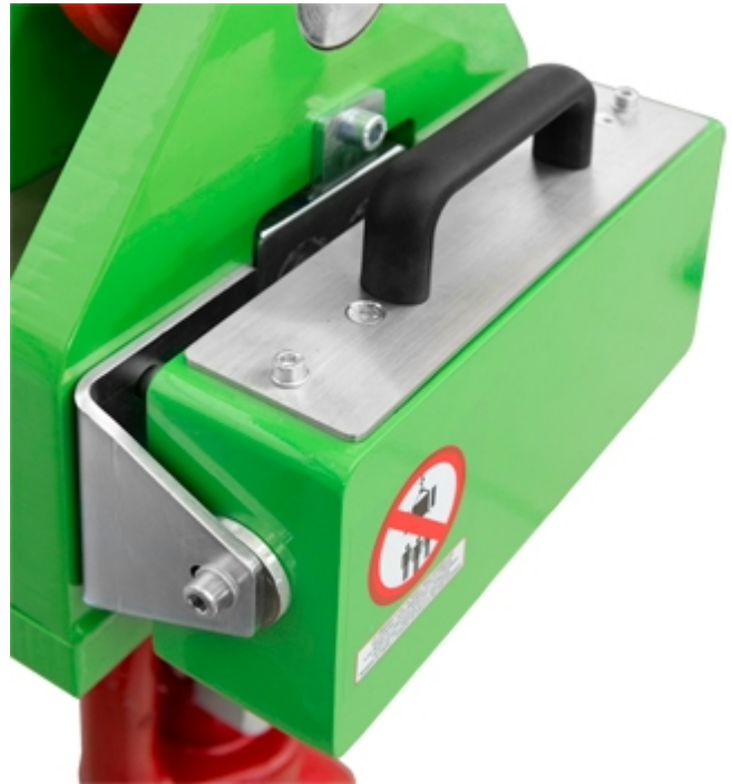
Fitted with extractable rechargeable battery pack.