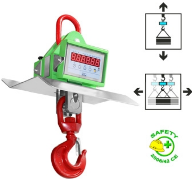
MCWHU with optional ring, swivelling hook and thermal shield