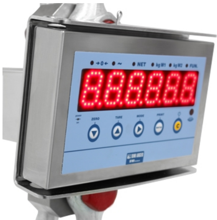
Crane scale MCW09: extra-bright 40mm display