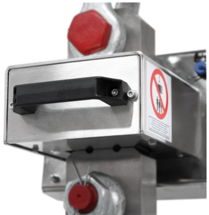
Crane scale MCW09: extractable battery view