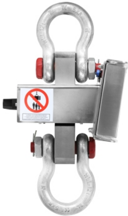
Crane scale MCW09: side view